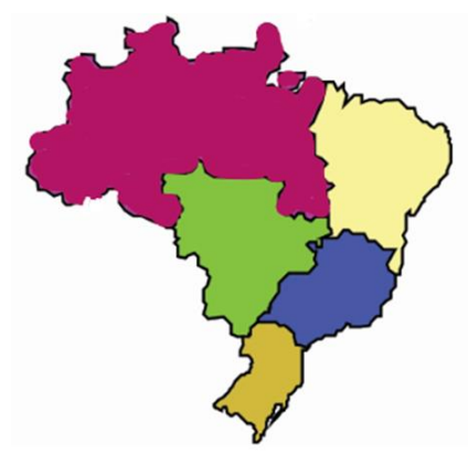
Figure 1 – Geographical location of the study area. North – purple; North-east –yellow; Central – green; South-east – blue; South - brown

Proportions of missing data in incident leptospirosis cases in each year were present for skin colour, schooling and disease outcome, as well as proportions of each disease outcome. Mean annual variation in such proportions and associated p-values were obtained as described above. All analyses were performed in R version 3.2.4 (<u>www.r-project.org</u>).